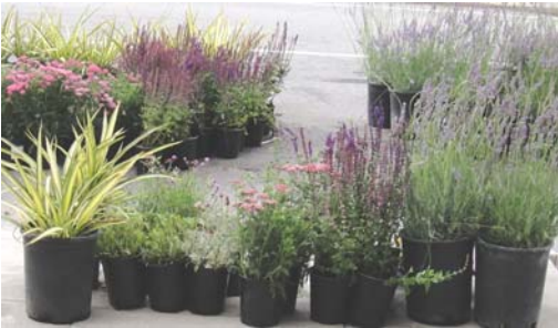
During Installation Before (Above); Plants (Below)

This garden was installed in July 2010 as a demonstration of converting large expanses of concrete with various species appropriate for the Sunset District. It is accessible by the N-Judah Muni Train. Located on city sidewalks, it is open for view, free of charge, all day, every day.